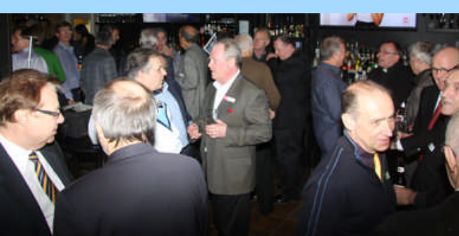
Class of 1973 40th Reunion.

In 2012, the Class of 1973 held a very successful 40th reunion, and class members are now planning to meet again on Friday, October 21, at St. Michael's College School. There will be more information to follow, please save the date.